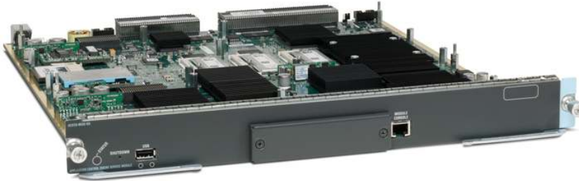
Figure 1. Cisco ACE Module for Cisco Catalyst 6500 Series Switches and Cisco 7600 Series Routers

By combining high-performance application delivery with a comprehensive set of state-of-the-art application delivery features, the Cisco ACE Module enhances IT efficiency and reduces the total cost of ownership (TCO). IT efficiency is increased through the use of innovative features such as virtual devices, role-based administration, instant application isolation, and single-view provisioning. Improved TCO is accomplished by consolidating most Layer 4 through 7 requirements into a complete and reliable application delivery platform.