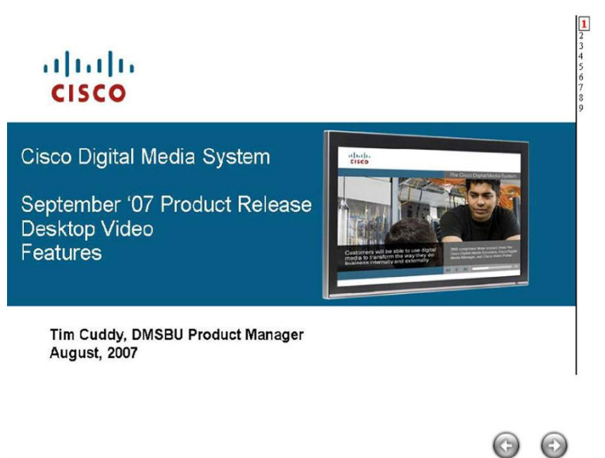
Figure 2. Advanced Slide Synchronize Console

When the event is complete, the producer can save the audio and video stream along with the synchronized slide graphics as a video-on-demand (VoD) file that the producer can then publish to Cisco Show and Share for viewer access anytime, anywhere.