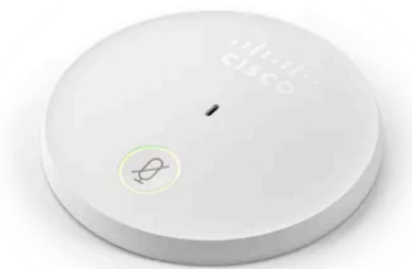
Figure 4. Cisco Table Microphone