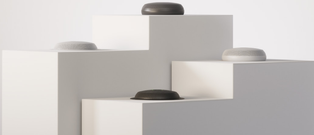
Figure 1. The Cisco Microphone Pro series of intelligent IP microphones: the Ceiling Microphone Pro and Table Microphone Pro in light and carbon color models, showing different mounting options.