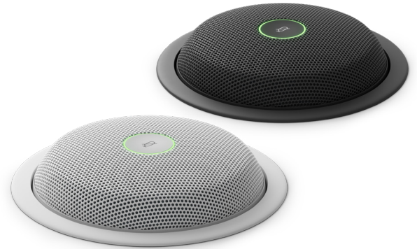
Figure 3. Cisco Table Microphone Pro