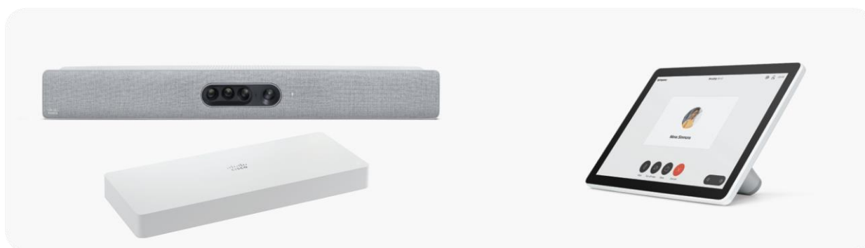
Figure 2. Default components of the Webex Room Kit Plus: Webex Codec Plus, Webex Quad Camera, Webex Room Navigator