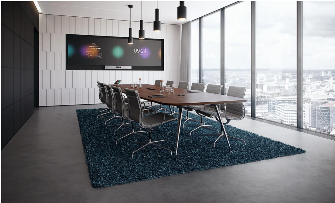
Figure 1. Webex Room Kit Plus in a conference room