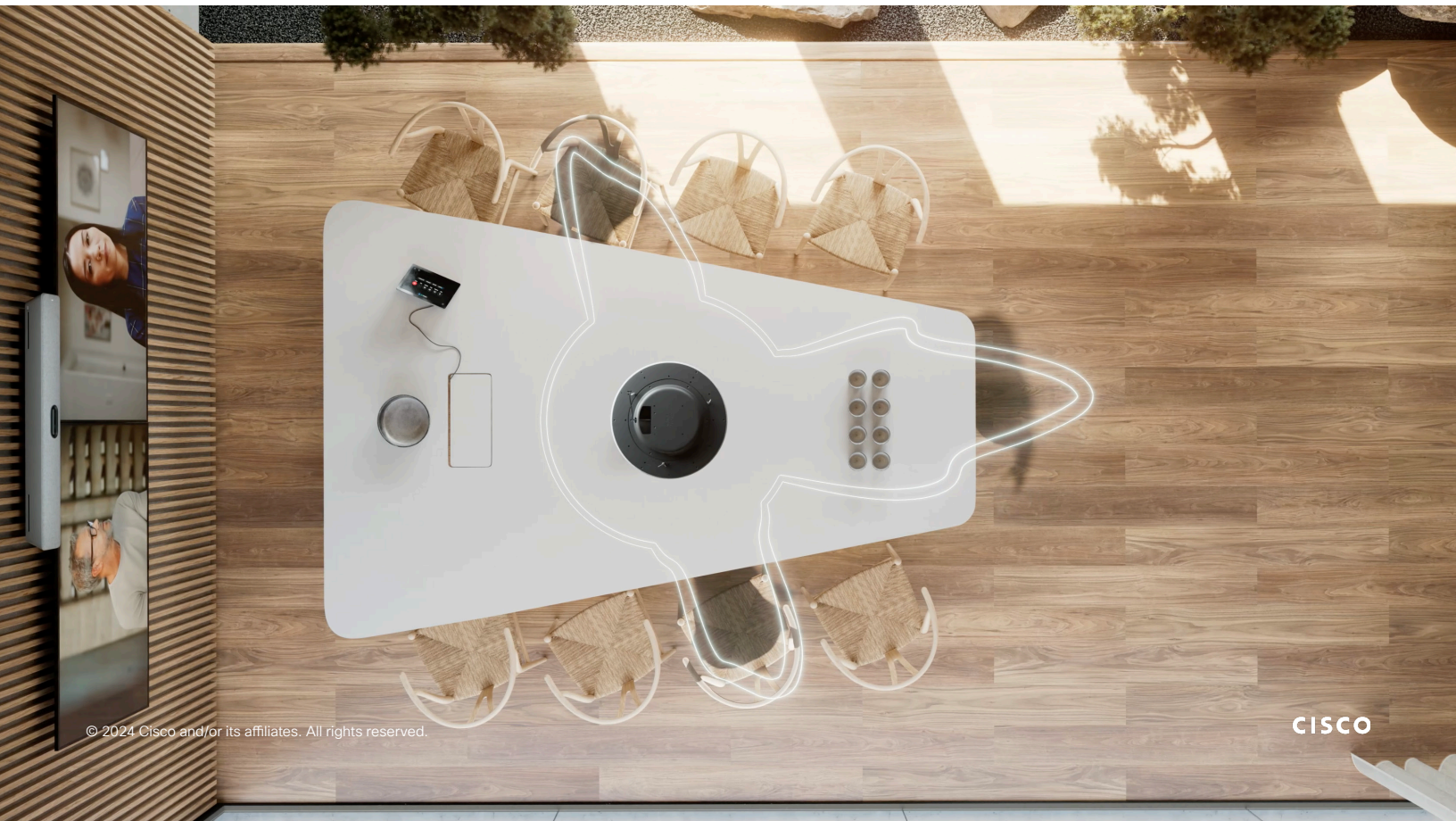
Figure 5: Adaptive beams tracking and capturing in-room participants' voices in a medium meeting room.