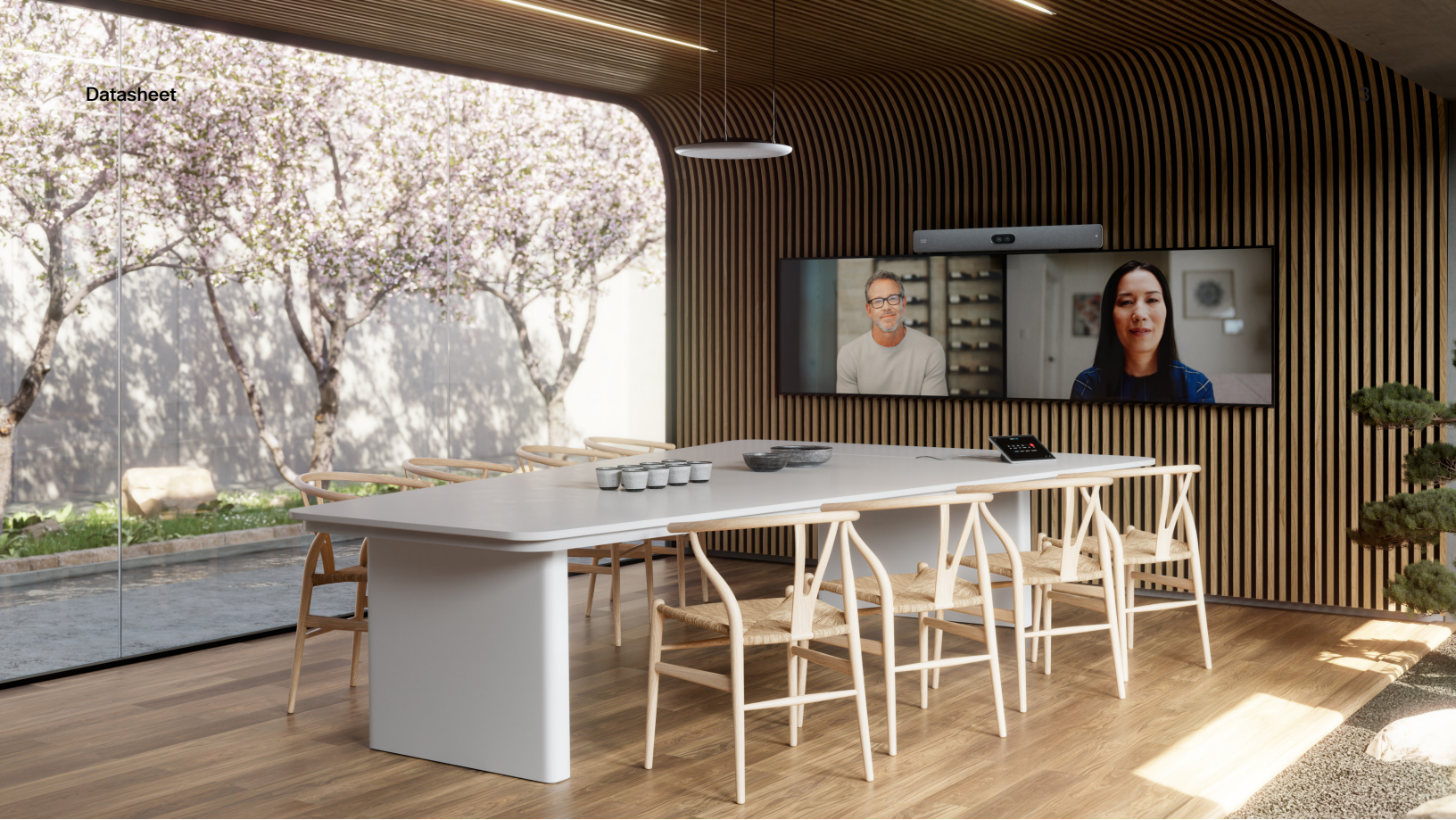
Figure 1: The Ceiling Microphone Pro in Arctic White with optional wire hanging mounting kit.

Cisco Ceiling Microphone Pro is an intelligent conferencing microphone device designed to capture directional audio from meeting rooms, boardrooms, training rooms and multi-purpose spaces. It supports your modern and flexible workspace layouts with AI adaptive beamforming that intelligently picks up active speakers' voices while following room dynamics and design changes. Better still, this ceiling microphone allows for rapid setup via zero-touch microphone configuration, scalable IP connectivity, embedded signal processing, and versatile mounting options.