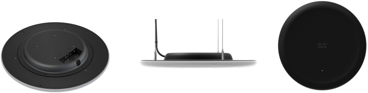
Figure 3: Ceiling Microphone Pro I/O area and rear panel, side view with wire hanging mount kit, and front grille with status LED.