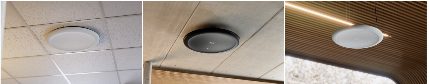
Figure 4: Ceiling Microphone Pro mount options: drop ceiling grid mount, ceiling bracket mount, and wire hanging ceiling mount.