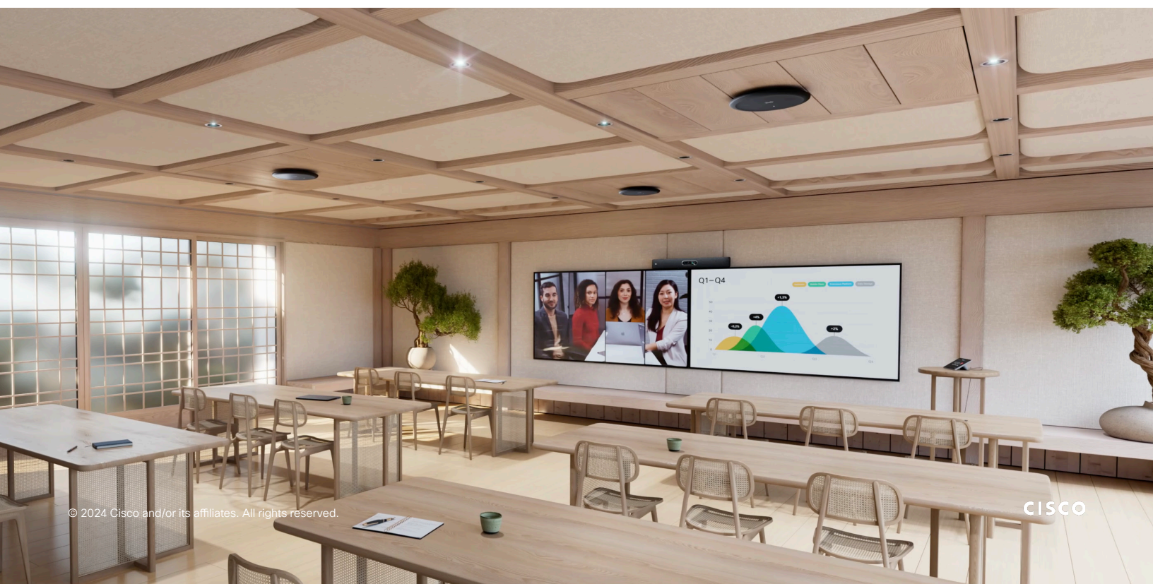
Figure 2: The Ceiling Microphone Pro in Carbon Black with optional ceiling bracket mounting kit.

The Ceiling Microphone Pro is designed to support the circular economy while offering flexible mounting options for a variety of common ceiling types to help you achieve a clean look and feel – for medium, everyday meeting rooms through large, divisible spaces. The unobtrusive, out-of-sight solution provides excellent, tamper-free coverage for an everyday meeting room, and can be automatically combined with other Ceiling Microphone Pros to scale and provide an outstanding acoustic experience in large and multi-purpose room scenarios.