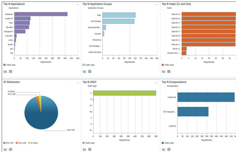
Figure 3. Cisco Prime NAM Traffic Summary Dashboard