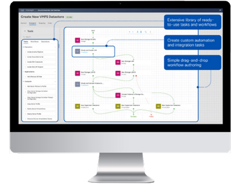
Figure 2. Accelerate delivery of applications and infrastructure using a drag-and-drop automation and workflow designer