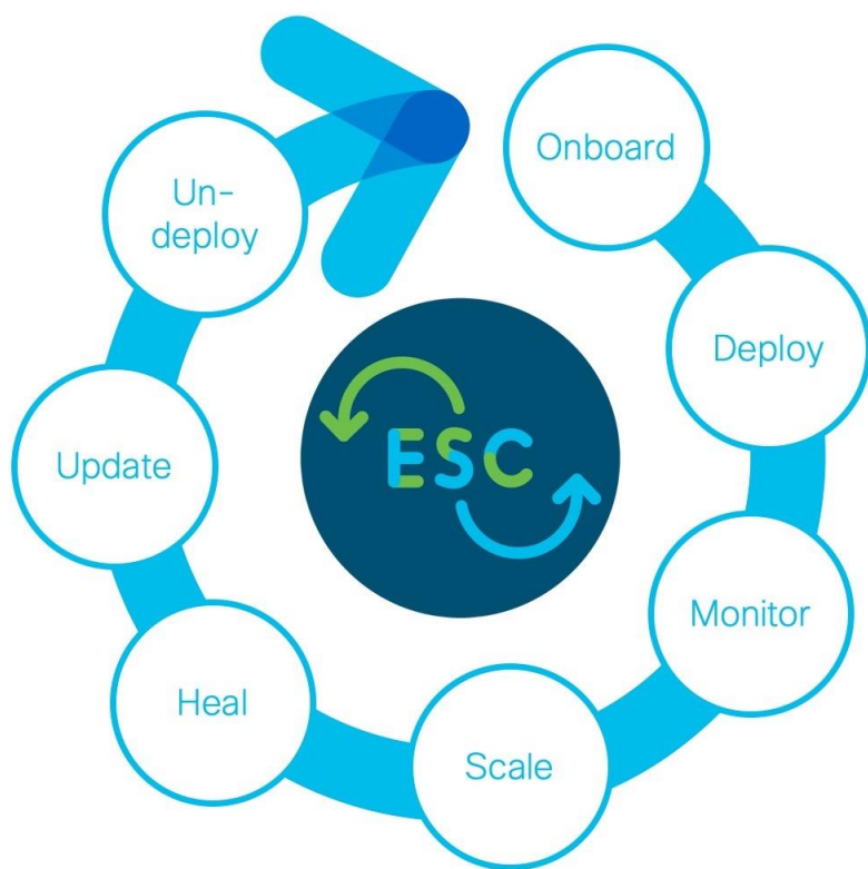
Figure 1. Cisco ESC lifecycle stages

Cisco ESC provides an integrated framework of tools that follow a virtual network function (VNF) throughout its entire lifecycle for both simple and complex multi-virtual-machine services. This includes a formal lifecycle stages (LCS) framework that allows you to define and vary policy based on the lifecycle stages identified in Figure 1.