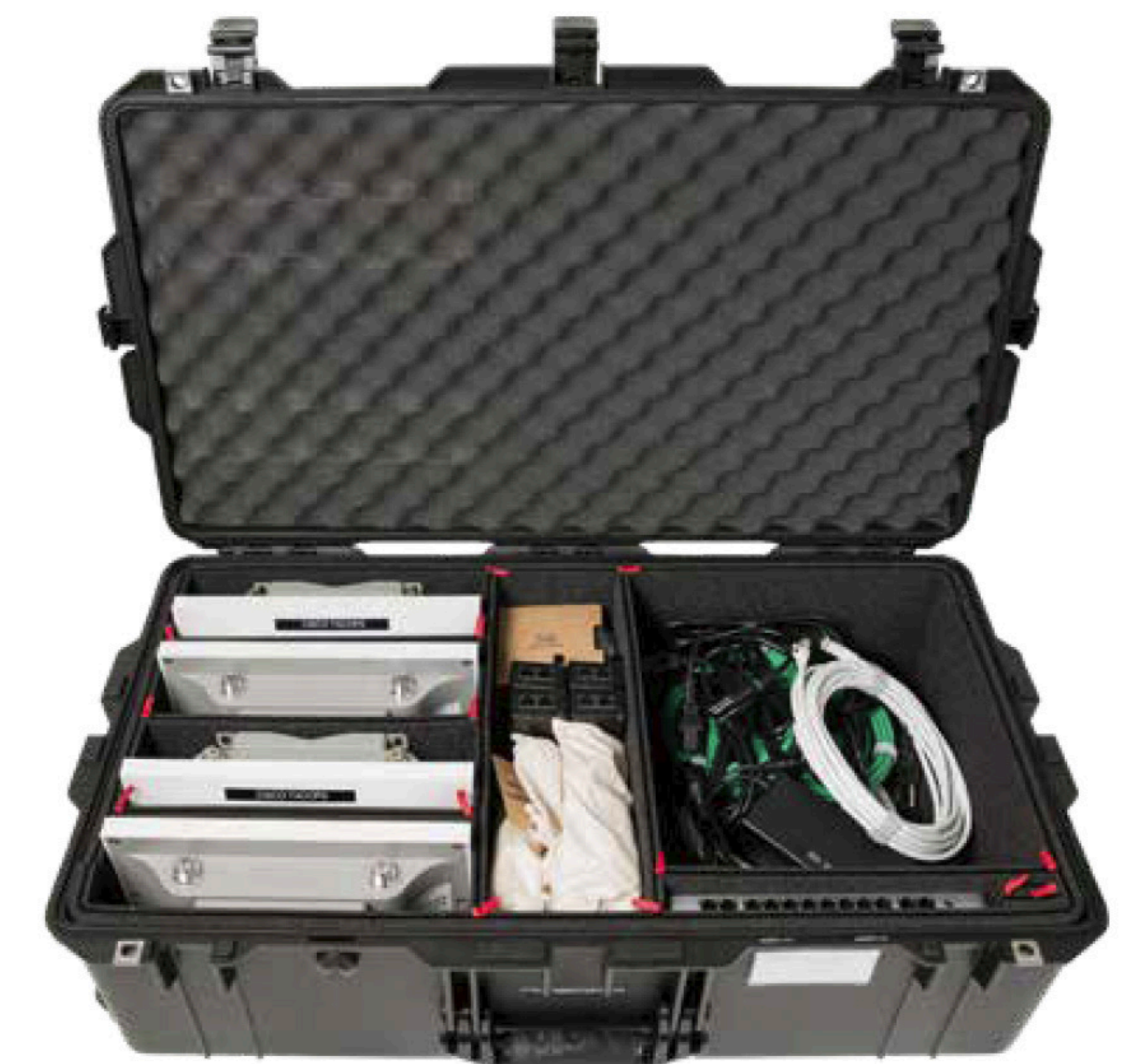
Figure 3. The Cisco Rapid Response Kit communications at their disposal.

user behavior, use a flexible policy toolkit that allows for the creation of flexible and specific application policies. Admins or IT staff can obtain the visibility required to optimize performance and build a scalable application-aware network that is built to last beyond the initial response.