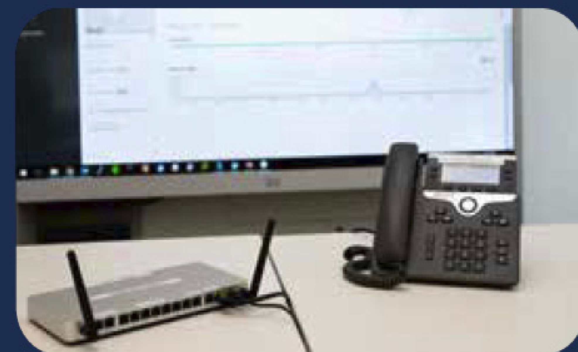
Figure 1. Centralized cloud management, RF Optimization + Application aware QoS for high throughput, high-density WLAN