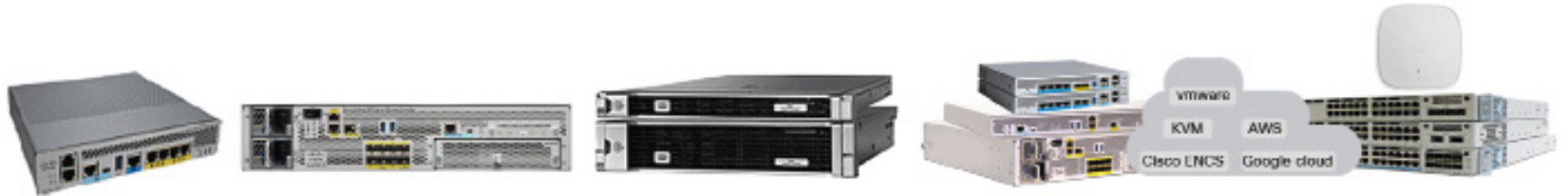
Table 1. Cisco wireless controller feature comparison