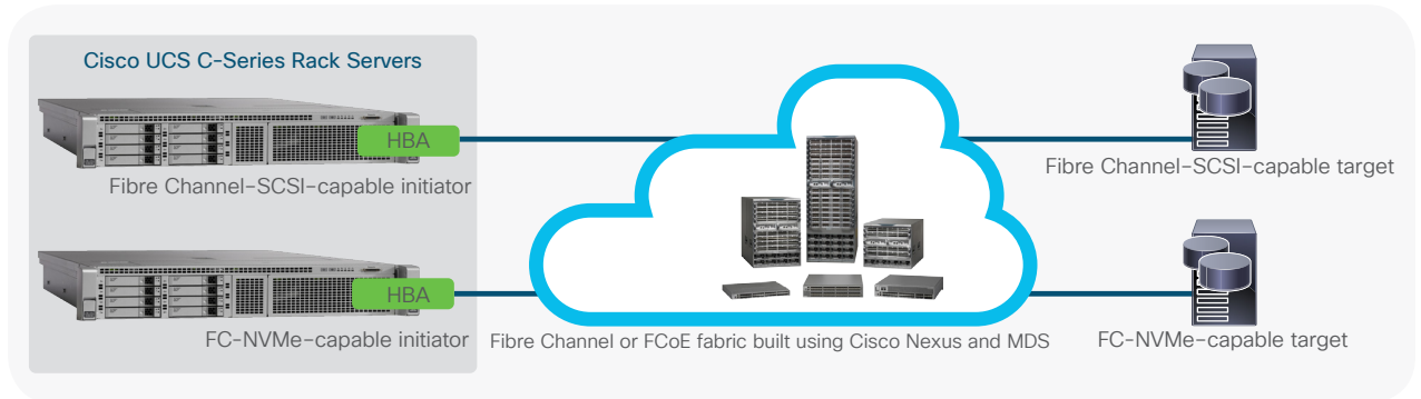
Figure 2. Seamless migration to FC-NVMe using Cisco Nexus and MDS

FC-NVMe on Cisco Nexus and MDS switches offers the following unique advantages: