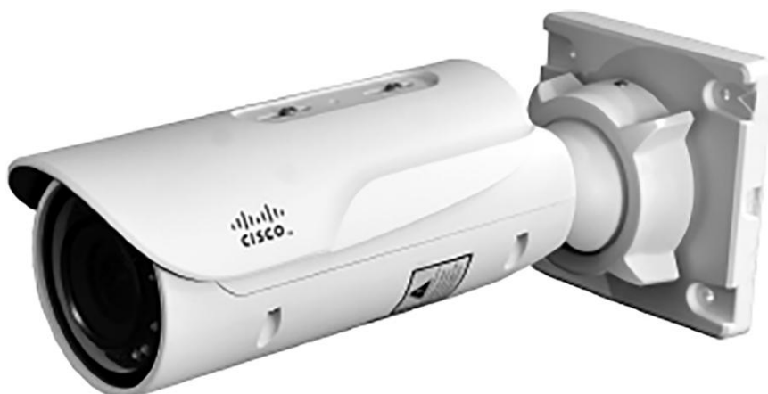
Figure 1. Cisco Video Surveillance 8400 IP Camera

The Cisco Video Surveillance 8400 IP Camera offers a variety of benefits, including: